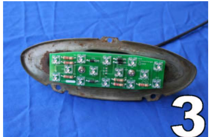
Correct placement of LED array.