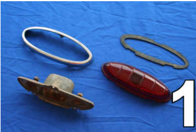
Remove and disassemble taillight.