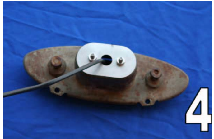
Tighten nuts after LED is squared in the housing.